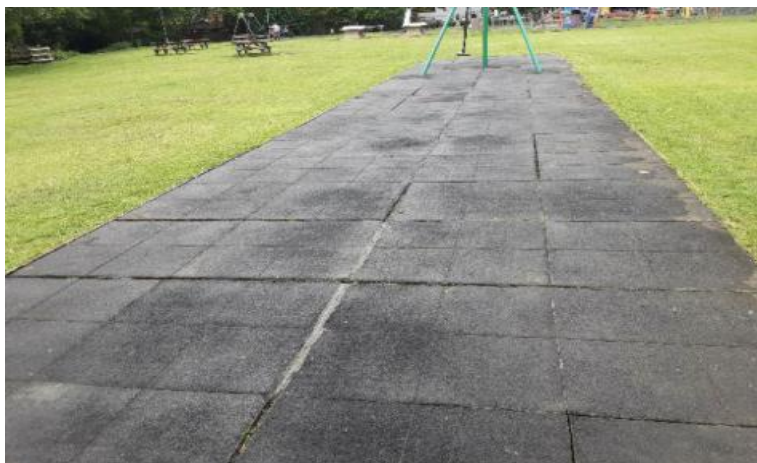
Image of Lion Green playground zip wire surface

The Amenities Committee was asked by Finance & Governance last year to identify play equipment projects as reserves had not been spent. The projects that were undertaken were subsequently funded by S106 contributions paid by Waverley BC, leaving the reserves largely intact. The Committee is asked to reconsider the resurfacing of the zip wire runway with a bonded rubber mulch.