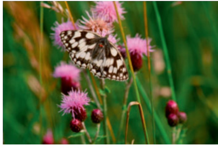
Marbled white butterfly, County: Hampshire

We will support biodiversity offsetting pilots through a two-year test phase, until spring 2014. Natural England will work with pilot areas, providing advice, support and quality assurance. The aim is to develop a body of information and evidence, so that the Government can decide whether to support greater use of biodiversity offsetting in England, and, if so, how to use it most effectively.