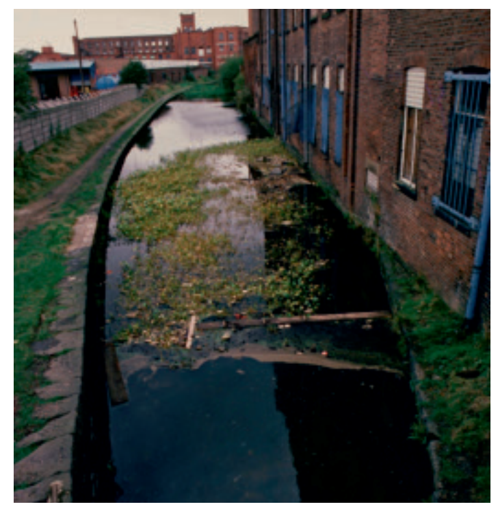
Arrowhead/industry, Site of Special Scientific Interest: Huddersfield Narrow Canal, County: West Yorkshire, Photographer: Peter Wakely

2.4 In order to halt overall biodiversity loss, support healthy well-functioning ecosystems and establish coherent ecological networks, with more and better places for nature for the benefit of wildlife and people, we need to establish more coherent and resilient ecological networks on land and at sea. Targeted action is also needed in respect of some priority species whose conservation is not delivered through these wider habitat and ecosystem measures, and also to conserve agricultural genetic diversity in cultivated plants, farmed animals and wild relatives