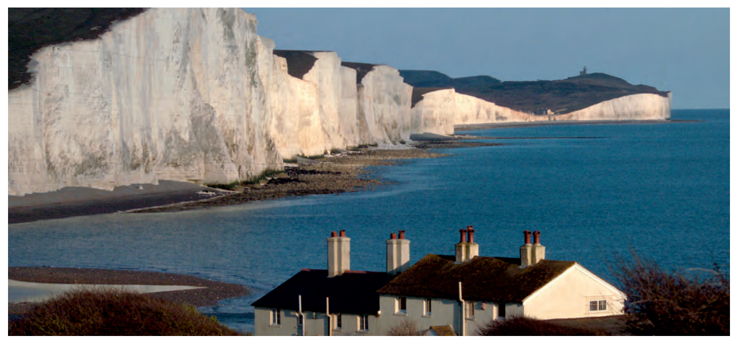
Seven Sisters, South Downs National Park.