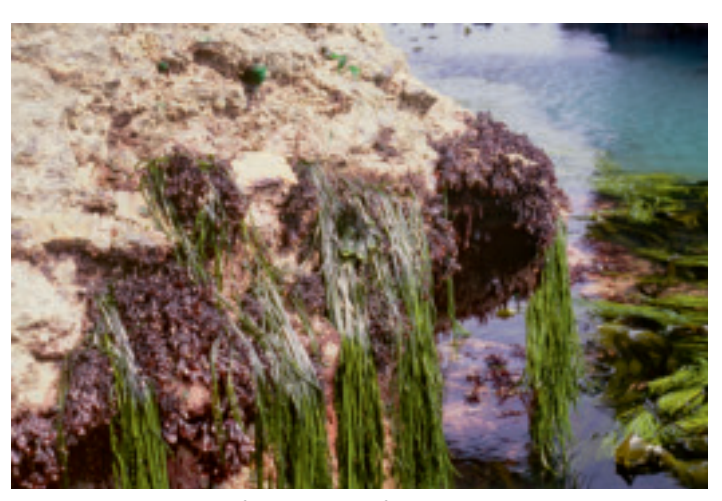
Algae in rock pool, Site of Special Scientific Interest: Lundy, County: Devon

Marine litter is also an issue. It can affect important marine species and place an additional pressure on the viability of already stressed fisheries. We know this happens across the world, but we do not fully understand the scale of the impacts. We will identify any additional measures necessary to move us towards achieving Good Environmental Status, ensuring these are in place by 2016. By 2014, our