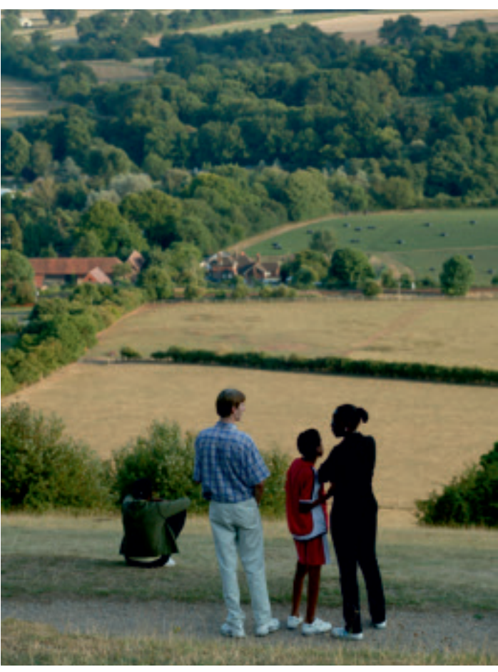
Rural countryside – people looking out at the views from Box Hill.