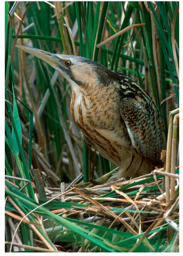
Bittern ( Botaurus stellaris )