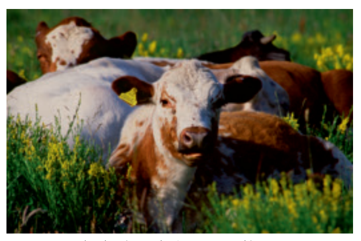
Dyer's greenweed and resting cattle, County: Hampshire

• The future role of the Common Agricultural Policy (CAP) from 2014 to 2020 is key to achieving our ambitions for enhancing environmental outcomes in tandem with food production. Successive reforms of the CAP have given it a greater focus on the achievement of public benefits, such as environmental outcomes and we want to see an acceleration of this process. Expenditure in a significantly smaller CAP Budget should tackle the key objectives of encouraging a competitive, sustainable EU agriculture sector, reducing reliance on subsidies and focusing resources on the provision of environmental public goods.