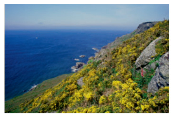
Bolt Tail, Bolberry Down – gorse, Site of Special Scientific Interest: Slapton Ley, National Nature Reserve: Slapton Ley, County: Devon