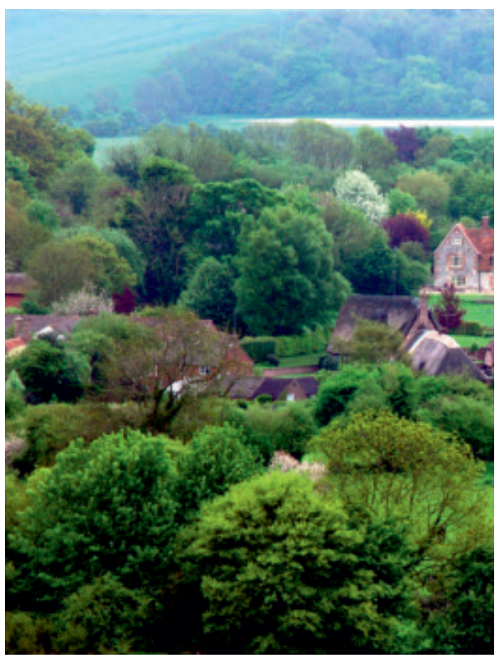
North Wessex Downs AONB (Area of Outstanding Natural Beauty).

Although biodiversity provides a range of benefits to people, these are often outside the market economy, meaning that they are unpriced and therefore too easily ignored in financial decisions<sup>18</sup>. We need to better take account of the values of biodiversity in decision-making. There is potential to expand and establish new markets and financing approaches for nature's services.