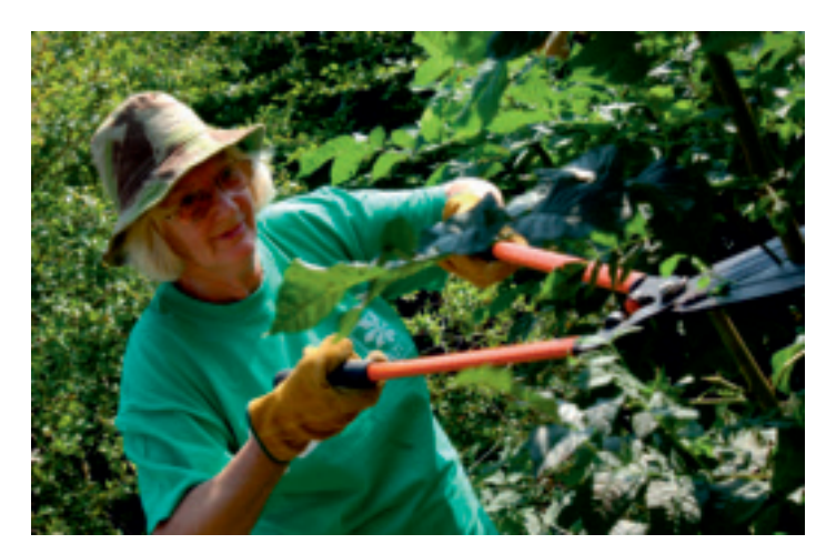
Volunteer actively engaged in rural community/voluntary work.