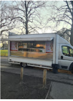
Haslemere kebab.jpg 512K