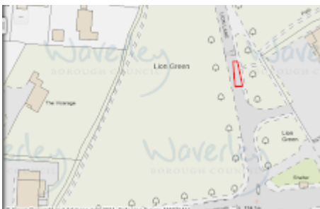
Haslemere kebab map.png 63K