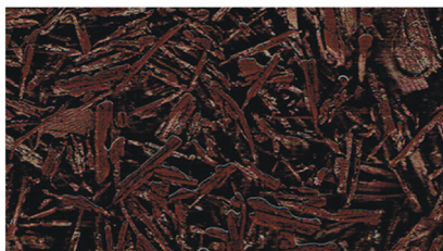
Earth Tone 2