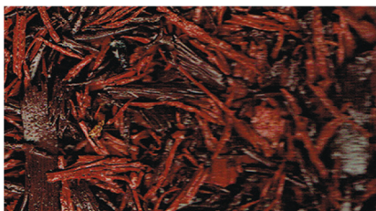
Redwood 1 (resin bound)