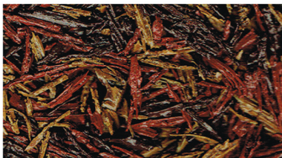
Autumn (resin bound)