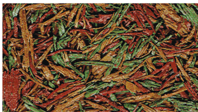
Jungle Jump (resin bound)

All our products are covered by a 5 year warranty