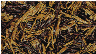
Earth Tone 1 (resin bound)