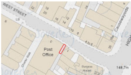
Little Fish Locker map.JPG 69K